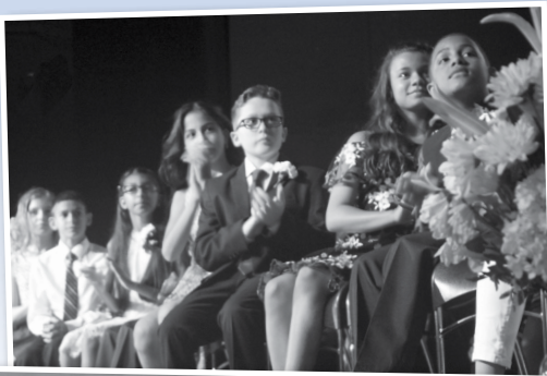
James A. Dever Elementary School Moving Up MONDAY, JUNE 18

This past June, students across the Valley Stream Union Free School District Thirteen celebrated their Moving-up Ceremonies in front of proud family and friends. Take a look at some photos from the beautiful celebrations at our four District schools.