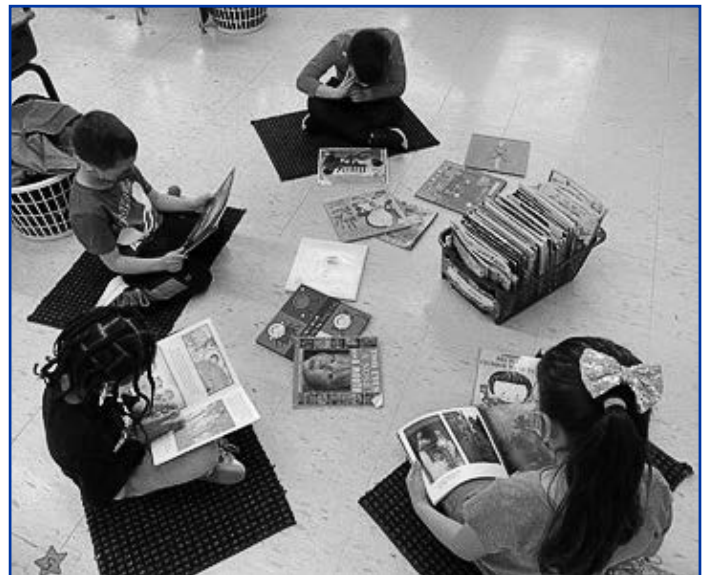
Students at James A. Dever Elementary School read together about different cultures and backgrounds.